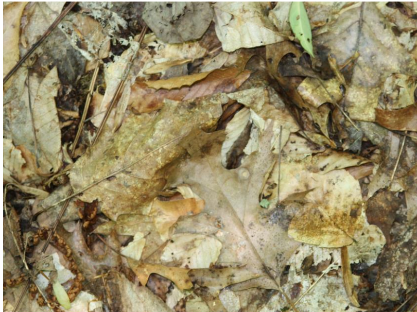
Fig. 2 – Forest floor leaf litter layer in Watershed 3.